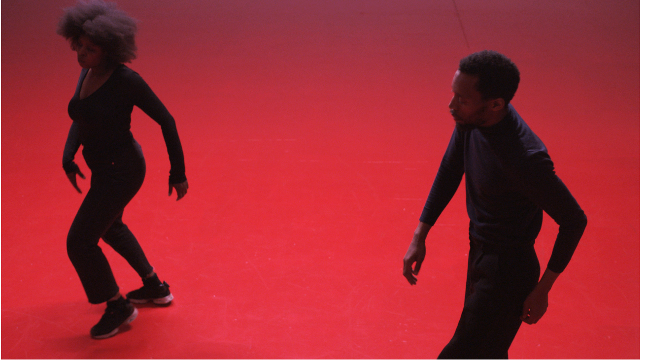
Christian Nyampeta, Sometimes it was beautiful , film still, video, colour, sound, 37:43 min, 2018.