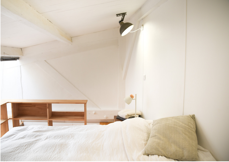
Interior view of the Pernod Ricard studio at Villa Vassiliev