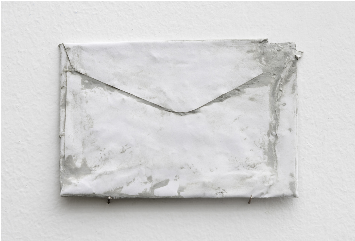
Jimena Croceri, Carta Pesada , paper envelope and cement, 2018.