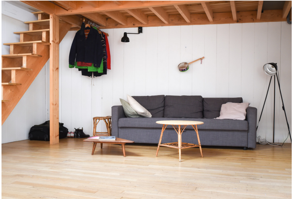
Interior view of the Pernod Ricard studio at Villa Vassiliev