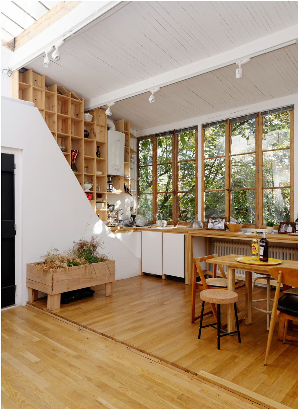
Interior view of the Pernod Ricard studio at Villa Vassiliev

Pernod Ricard is a renowned actor in the French and international contemporary art scene. The group is a prime supporter of many art institutions, among which Centre Pompidou, Tate Modern, Guggenheim Bilbao, while its various foundations (Fondation Ricard for Contemporary Art, Martell Foundation, etc.) conduct numerous actions in support of contemporary art and artists. Its motto: "creators of conviviality"!