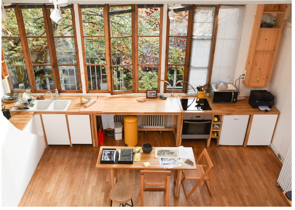
Interior view of the Pernod Ricard studio at Villa Vassiliev